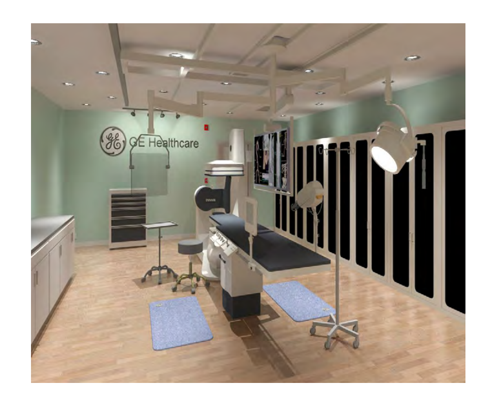
Single Plan Innova IGS 530

Hold the Left Click for Rotating around Use the Scroll for Zooming in and out