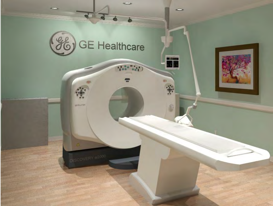
6-104 - Revolution DiscoveryGSI HD w-2000 Table

Hold the Left Click for Rotating around Use the Scroll for Zooming in and out