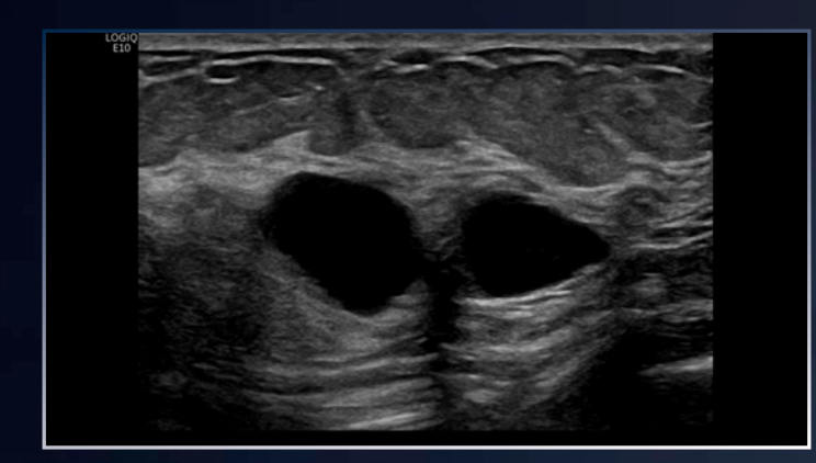
Breast Cysts, ML6-15-D

Choice of high-performance probes: Select from E-Series and XDclear probes, including high-frequency probes designed for breast applications.