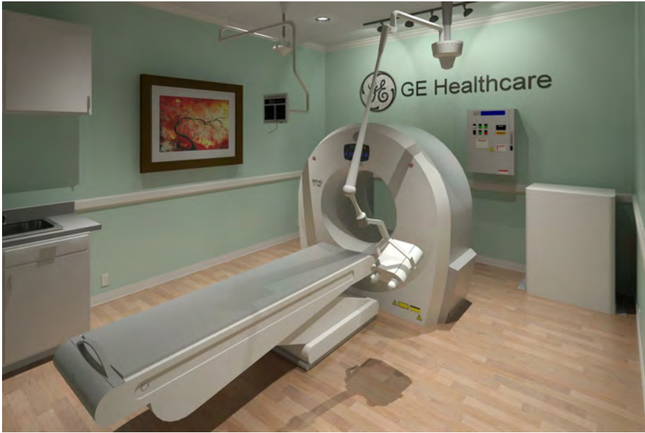
6-92 - Brivo CT385

Hold the Left Click for Rotating around Use the Scroll for Zooming in and out