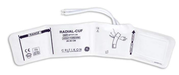
Figure 2. CRITIKON RADIAL-CUF BP cuff with DINACLICK* connector

The CRITIKON RADIAL-CUF BP cuff was clinically validated to the AAMI/ANSI/ ISO 81060-2 (2009) standard for NIBP accuracy using a radial intra-arterial reference.<sup>25</sup> It is intended for adults with a forearm circumference range of 26-36 cm and who cannot be properly fitted with an upper arm cuff. This includes patients having an upper arm circumference >40 cm, patients on whom the upper arm is conical, patients where the cuff has a gap near the bottom edge, and/or patients where the upper arm cuff is too long, causing it to overlap the elbow. The forearm cuff is conical to properly fit the shape of the forearm.