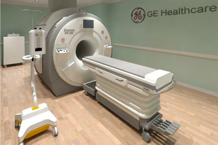
8-226 - Discovery MR450 1.5T

Hold the Left Click for Rotating around Use the Scroll for Zooming in and out