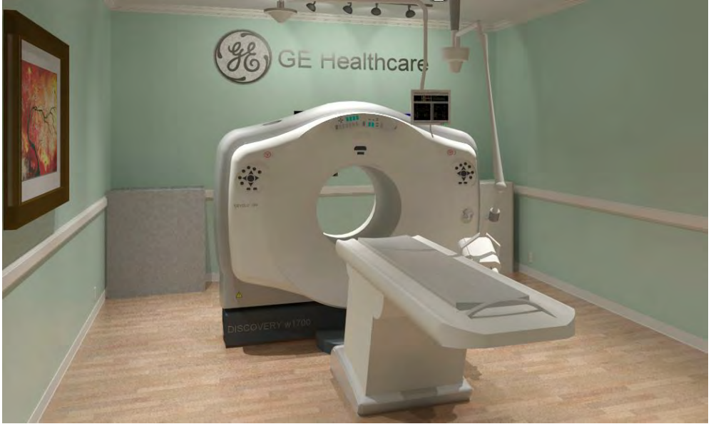
6-102 Revolution Discovery CT GSIHD w1700 Table

Hold the Left Click for Rotating around Use the Scroll for Zooming in and out