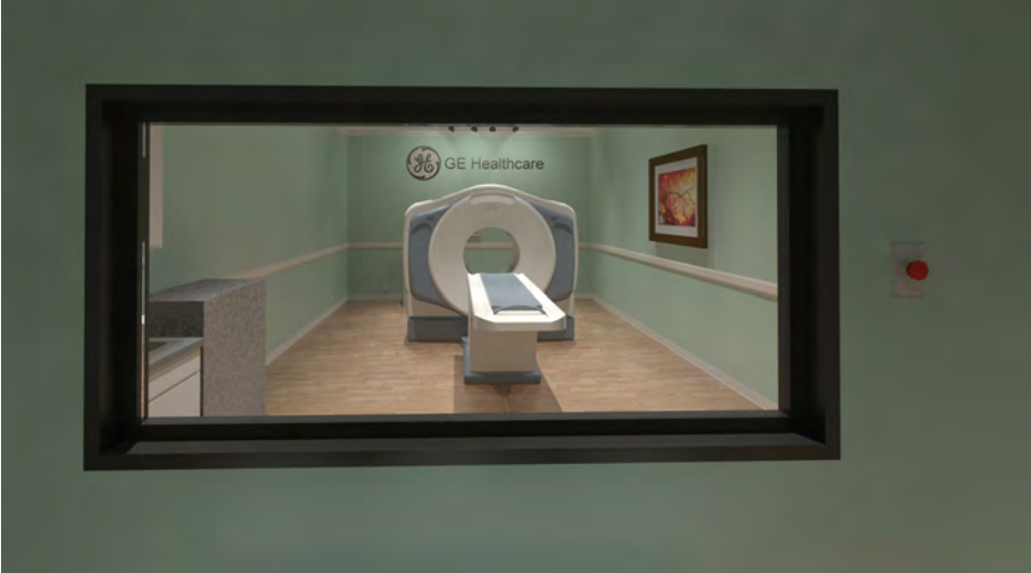
6-68 - Discovery CT750 HD w-1700 Table

Hold the Left Click for Rotating around Use the Scroll for Zooming in and out