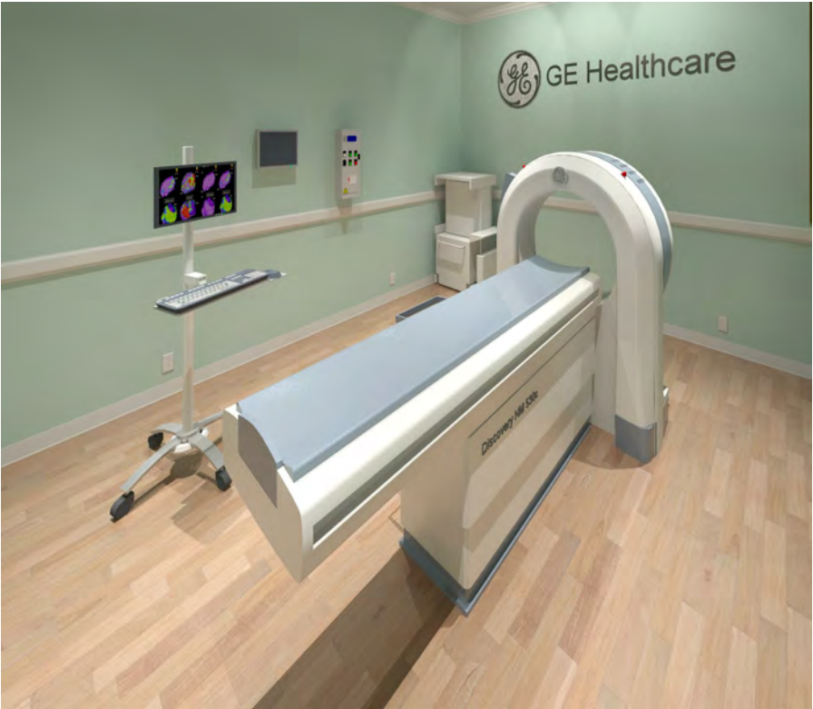
7-70 -Discovery NM 530c

Hold the Left Click for Rotating around Use the Scroll for Zooming in and out