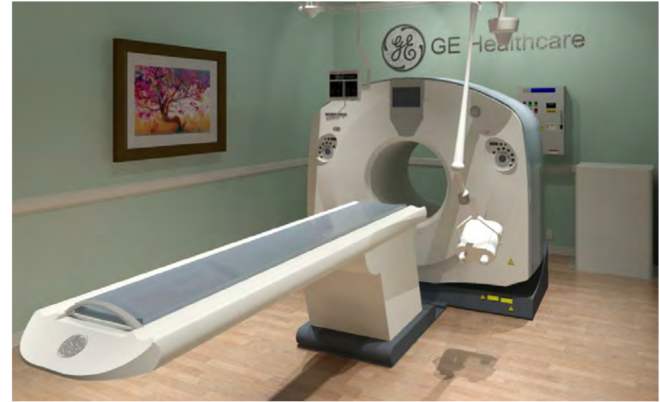
6-100 Revolution EVO w2000 Table

Hold the Left Click for Rotating around Use the Scroll for Zooming in and out