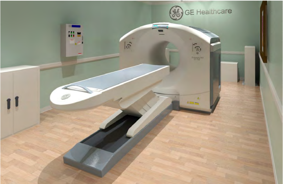
12-28 - Discovery PET-CT 710

Hold the Left Click for Rotating around Use the Scroll for Zooming in and out