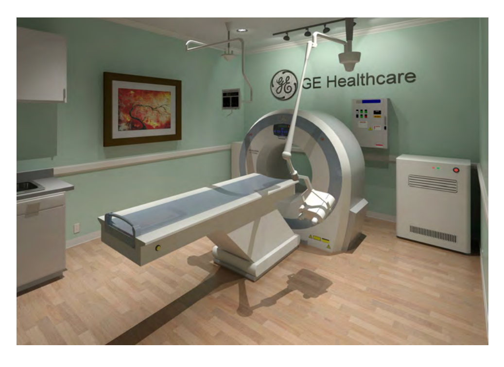
6-108-Revolution ACTs 8 Slice

Hold the Left Click for Rotating around Use the Scroll for Zooming in and out