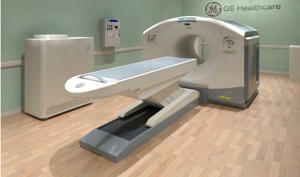
12-22 - Discovery PET-CT 690 Elite

Hold the Left Click for Rotating around Use the Scroll for Zooming in and out