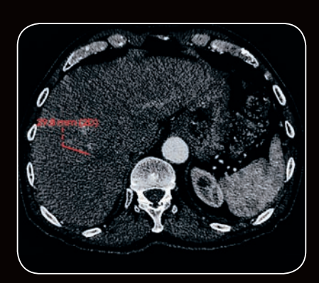
Figure 1. CT at early portal venous phase

The following case from Dr. Boulay illustrates how RECIST and MR imaging provide a full multi-modality assessment for oncologic patients.