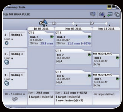
Figure 2. OncoQuant Summary Table of results