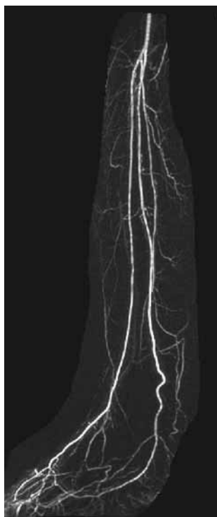
12cc Gd injection demonstrating visualization of the vessels of the lower limb.

By performing a 3D TRICKS™ (Time Resolved Imaging with Contrast Kinetics) acquisition in a sagittal scan plane, rather than the conventional coronal, the lower limb vasculature from trifurcation to dorsal pedal arch can be covered with a smaller number of slices and therefore improve temporal resolution.