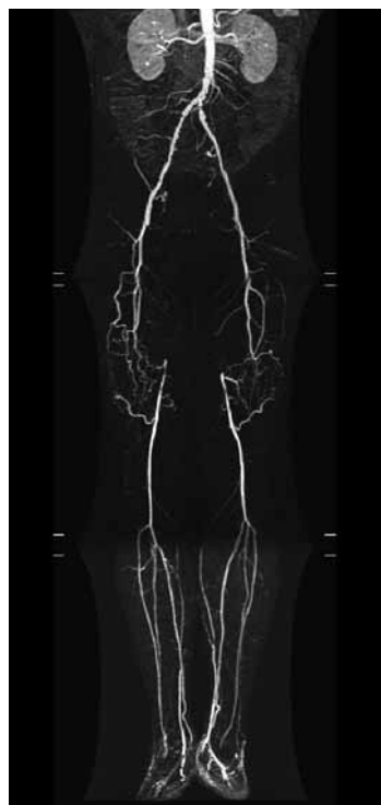
Bolus chase MRA with Image Pasting