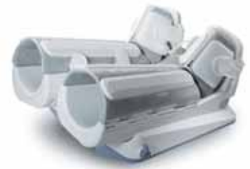
Signa HD Lower-Leg Array