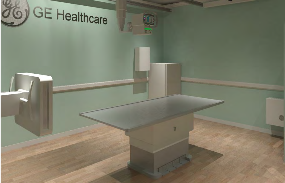
1-154 - Discovery XR656 Plus

Hold the Left Click for Rotating around Use the Scroll for Zooming in and out